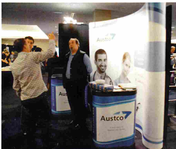
Gold Sponsor Austco's display