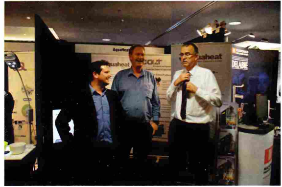
Aquaheat people tidying up for photo shoot