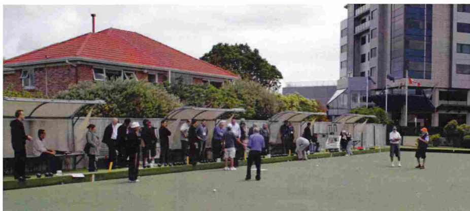
Recreation between sessions, and learning a new skill