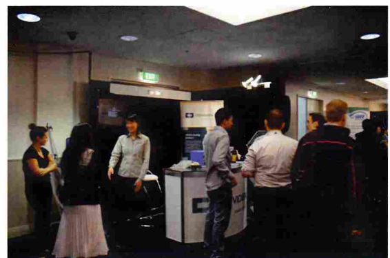
The Covidien stand (Gold sponsor) was a busy corner all evening