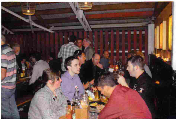
A group enjoying the pre-conference night out at the Mexican Bar